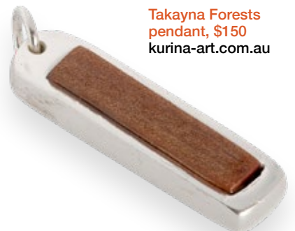
Takayna Forests pendant, $150 kurina-art.com.au