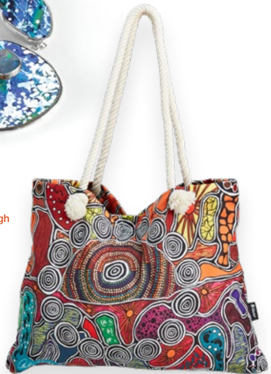
Weaving Through Time bag, $30 lifewear.com.au