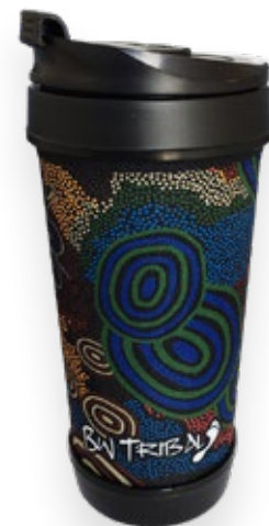
Travel Mug Colours Of Our Land, $18.50 bwtribal.com