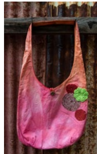
Warta Tjitan tote bag, $45 desertgem.com.au