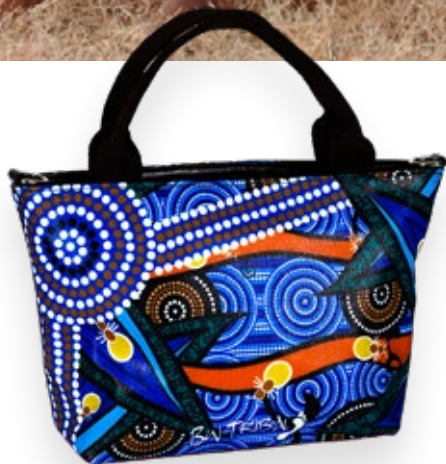
Handbag Honey Ant Dreaming, $89.99 bwtribal.com