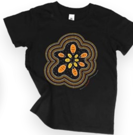
Honey Ant T shirt, $40 mydreamtimearts.com