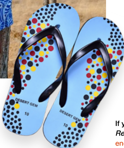
'Parna' (blue) and 'Kapi' (brown) flip flops, $15 desertgem.com.au Available in men's and women's sizes

If you would like your products to feature in the next issue of Reconciliation News , please contact us at enquiries@reconciliation.org.au