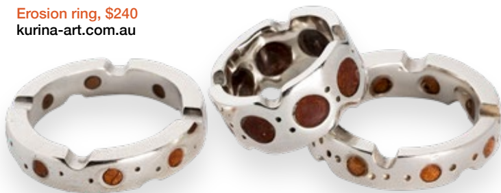
Erosion ring, $240 kurina-art.com.au