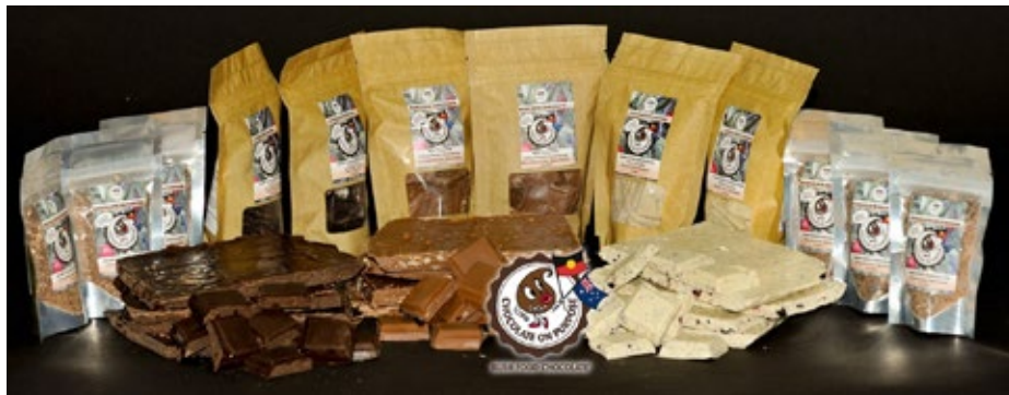
Chocolate variations, $11 per 100g bag facebook.com/ChocolateOnPurpose