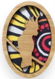
Birmba brooch, $25 milicairns.bigcartel.com